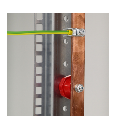
detail view: mounted supporting insulator and busbar terminal